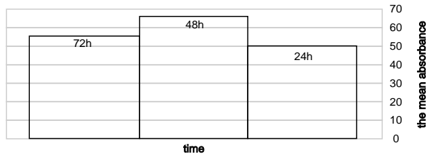
Figure 1: Average absorbance on epithelial cell of AGS cell line at different times.

The means of absorbance obtained from control group of the AGS cell line at intervals of 24, 48 and 72 hours are 49.92, 65.92 and 55.34. The result is illustrated in Figure 1.